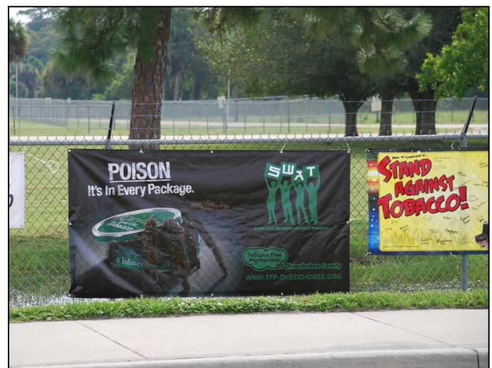
The Tobacco Free Partnership and Students Working Against Tobacco (SWAT) participated in a recent summit on the availability of Spice and other synthetic cannabinoids in Okeechobee County.